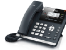
Yealink T4 series