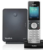
Yealink DECT Cordless